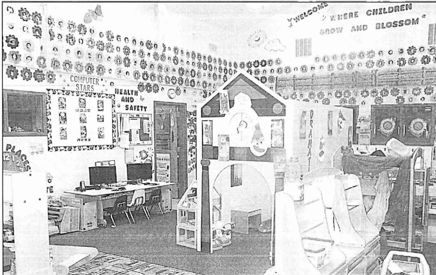
The Exploration Room serves as an extension of the classroom at The Goddard School . It also provides a fun place to play when the weather keeps the children inside.

Printing imperfections present during scanning